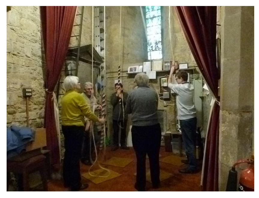
BELLRINGERS AT WORK ON 11 NOVEMBER 2018

The bell ringers practise once a week and are members of the Daventry branch of the Peterborough Guild of Church Bellringers, who meet monthly.